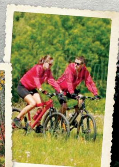
Caption to go here?