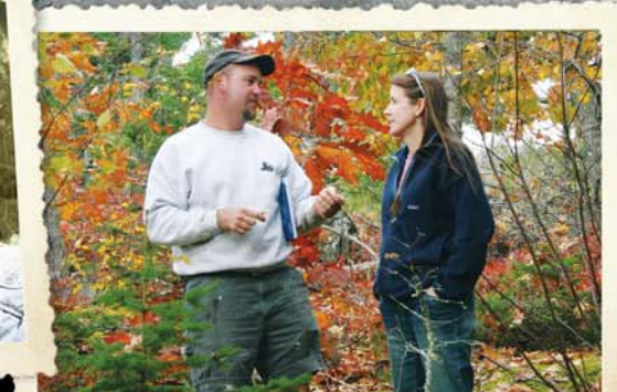
Caption to go here?