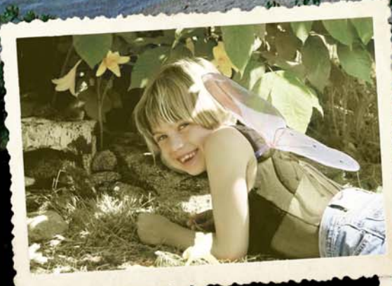
Caption to go here?