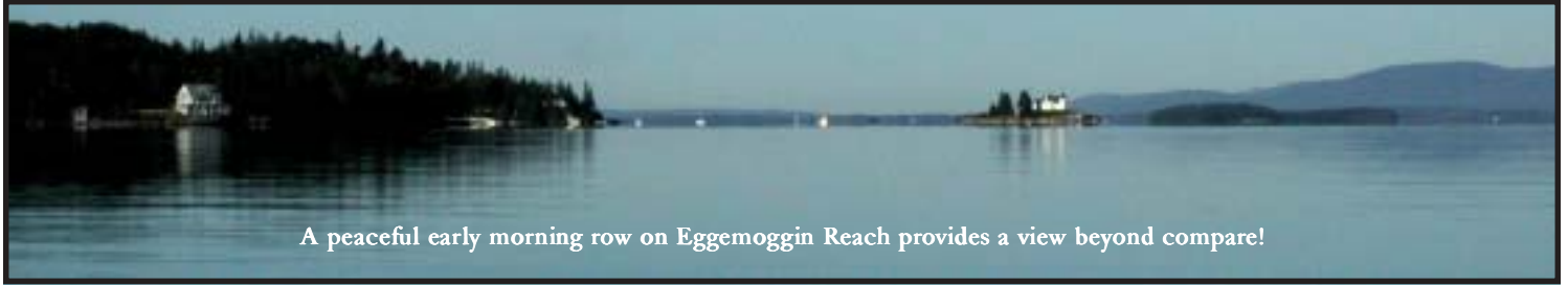
A peaceful early morning row on Eggmoggin Reach provides a view beyond compare!

Download this newsletter in color from www.oaklandhouse.com/mailings/earlyspring2005 . You will need Adobe Acrobat Reader software which you can get FREE from Adobe.com.