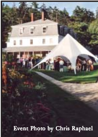
Event